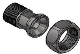
THREAD ON 1/2" MNPT